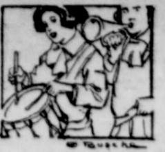
The Drum and the Trumpet Sounded.

Other sugar beet producing states are Arizona, Illinois, Iowa, Kansas, Minnesota, Montana, Nebraska, New York, Ohio, Oregon and Washington.