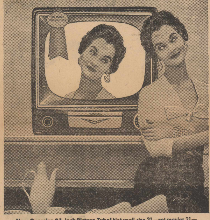
New Oversize 21-inch Picture Tube! Not small-size 21—not regular 21—but RCA Victor's new Oversize—today's biggest, finest picture in 21-inch TVI

Just one of the 5 luxury features in the