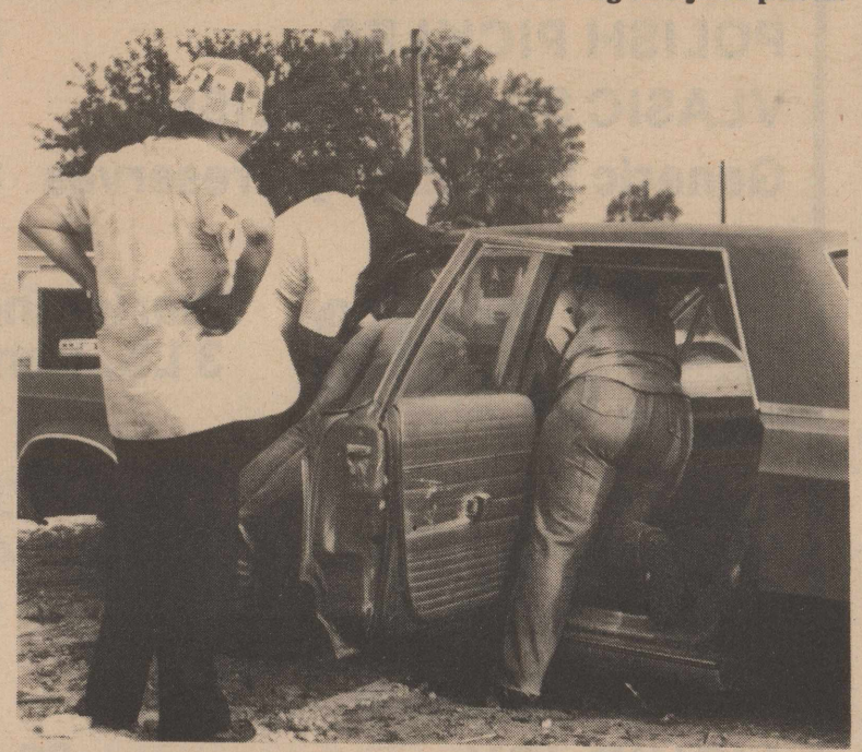
INSTRUCTOR LOU WRIGHT removing a victim from a wreckoversees the act of EMT students ed vehicle.