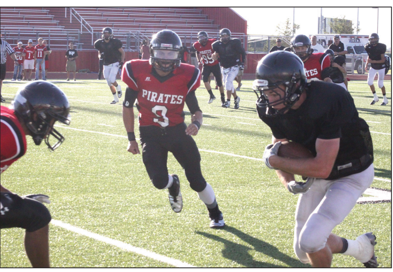
An unidentified Mule carries the ball during Friday's scrimmage against Lubbock Cooper.