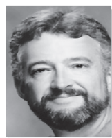
Focus On Faith Curtis Shelburne

On "Shark Tank" a panel of "sharks," successful (whatever that is) business folks who have achieved the kind of amazing success (whatever that is) that we all are supposed to desire, listen to pitches by fledgling entrepreneurs hoping to enlist some