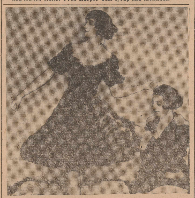
ODDITY . . . Hair-dresser's pride is this dress of human hair, fashioned of matching hues, exhibited in London.

War would not lose his entitle-|roll was called eleven times. So ments to get a home loan un- you can see what filibustering der the Korean bill, merely be- in the House means. cause he had used his entitlements under the World War II Shop the ads—Try Stratford first bill. Many of these boys who have been called back in had just got started in civilian life and had a small equity in their homes. When they were called back in, they had to sell those homes and use that equity to pay up their bills and take care of their families. Had we failed to get this amendment in, a great injustice would have been