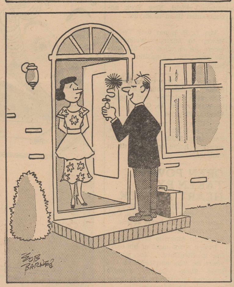
'I'M AFRAID I CAN'T TELL YOU WHAT IT'S FOR, MADAM — BUT WHERE COULD YOU GET ONE LIKE IT FOR ONLY 59 CENTS?'