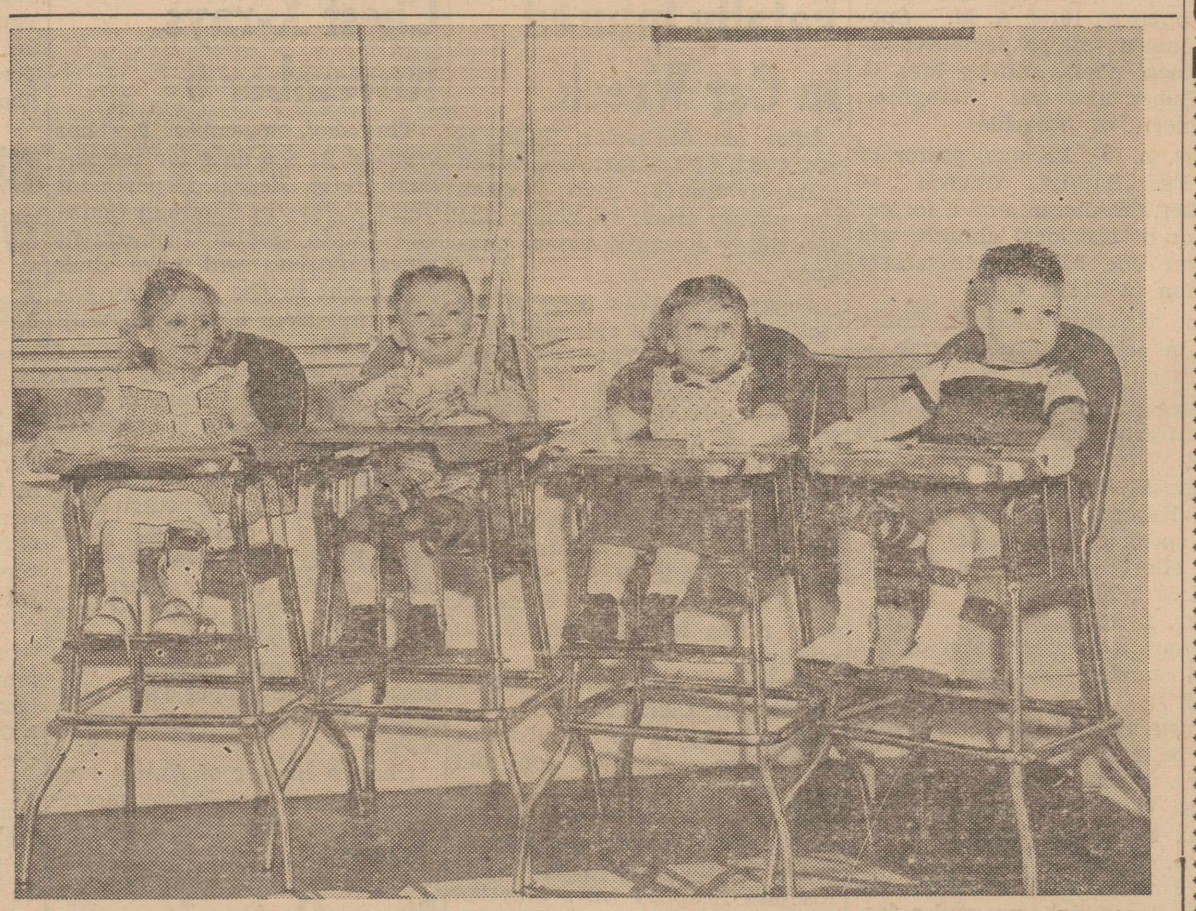
THE HIGHCHAIR BRIGADE—Mealtime creates a lot of interest among all age groups at Gonzales Warm Springs Foundation, and the highchair set is no exception. Appetites are sharpened by the rigors of the treatment program, made possible by the warm-hearted generosity of thousands of Texans from every corner of the state.

BIRD'S EYE VIEW—From the air, Gonzales Warm Springs Foundation for Crippled Children looks like a rambling country estate. In this friendly atmosphere hundreds of physically handicapped youngsters of Texas each year are helped back along the road to strength and usefulness. This hospital of physical medicine and rehabilitation was built with funds provided by warm-hearted Texans from every corner of the state, and its facilities are available to any child, regardless of race, color, creed or financial circumstance as long as the treatment program will benefit him.