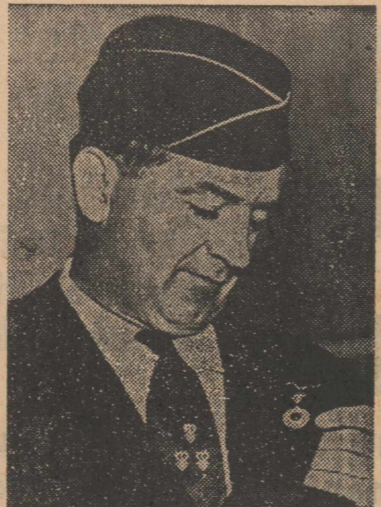
MEDAL FOR JOE . . . Red prober Sen. Joseph R. MoCarthy (R) of Wisconsin, chairman of Senate permanent investigations committee, admires "Bill of Rights" gold medal awarded him by American Legion, Wall St. post.