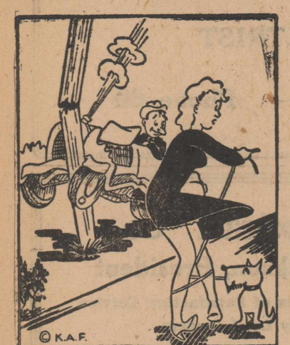
"Haven't seen a dog like that in years.

OME IN PLEASE DRIVE OUT PLEASED امالاه المالاه