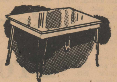
Table and Six Chairs