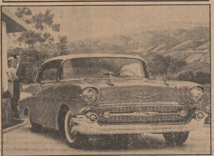
Highlights of 1957 Chevrolet exterior design include front and rear bumper assemblies blending into the body, twin lance windsplits on the hood and flared rear fenders. A silver anodized aluminum grille screen and harmonizing color of roof and lower body further distinguish this sport sedan in the "Two-Ten" series.