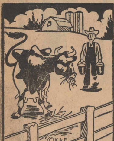
Oh, Oh - Here's ole' icy fingers.

We have the "touch" for dependable service. We're friendly folks who want to keep your good will and do everything we can to make it possible.