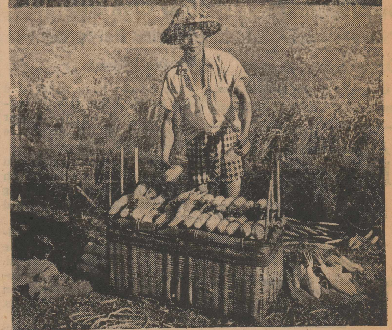
FOOD FOR FREE CHINA . . . Taiwan farmer shows huge white beets grown on Formosa farm. Irrigation produces fine crops of beans, sweet potatoes and beets.

At the equator days and nights social committee, were enjoyed gram on the food service plan are almost the same length all