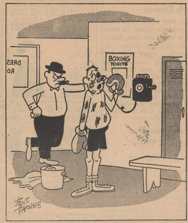
"Cancel that chartreuse sport car I ordered yesterday."