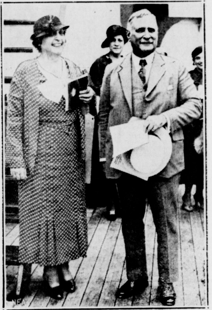
Col. Carlos Mendiceta, prominent in the island's politics for 30 years, is Cuba's sixth president in the last five months, succeeding Carlos Hevia in a bloodless coup.