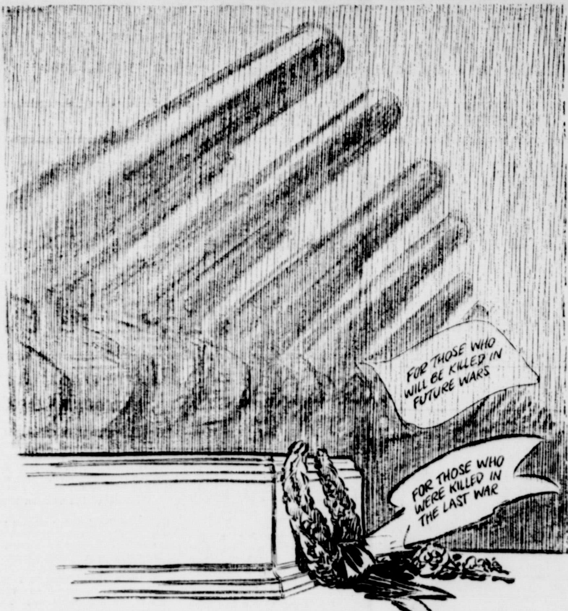
"Let Us Pledge Ourselves Anew to Patriotic Service"