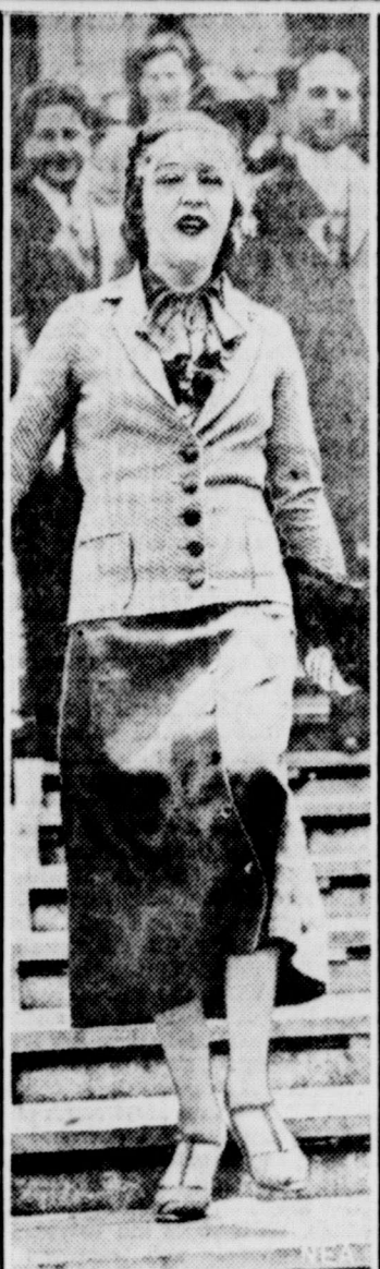
After losing her $300,000 suit against a film company for alleged back payment due her, Mae Murray, the screen actress, was in no mood to be twitted. So when an attorney for the defense ventured to remark, "Now you've got justice," Mae retaliated with a stinging smack across his mouth. That's Mae leaving court after the fracas.