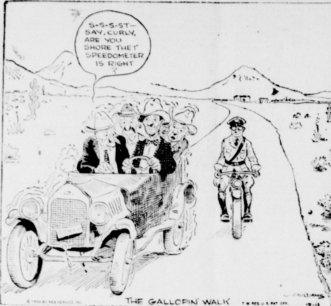
THE GALLOPIN' WALK