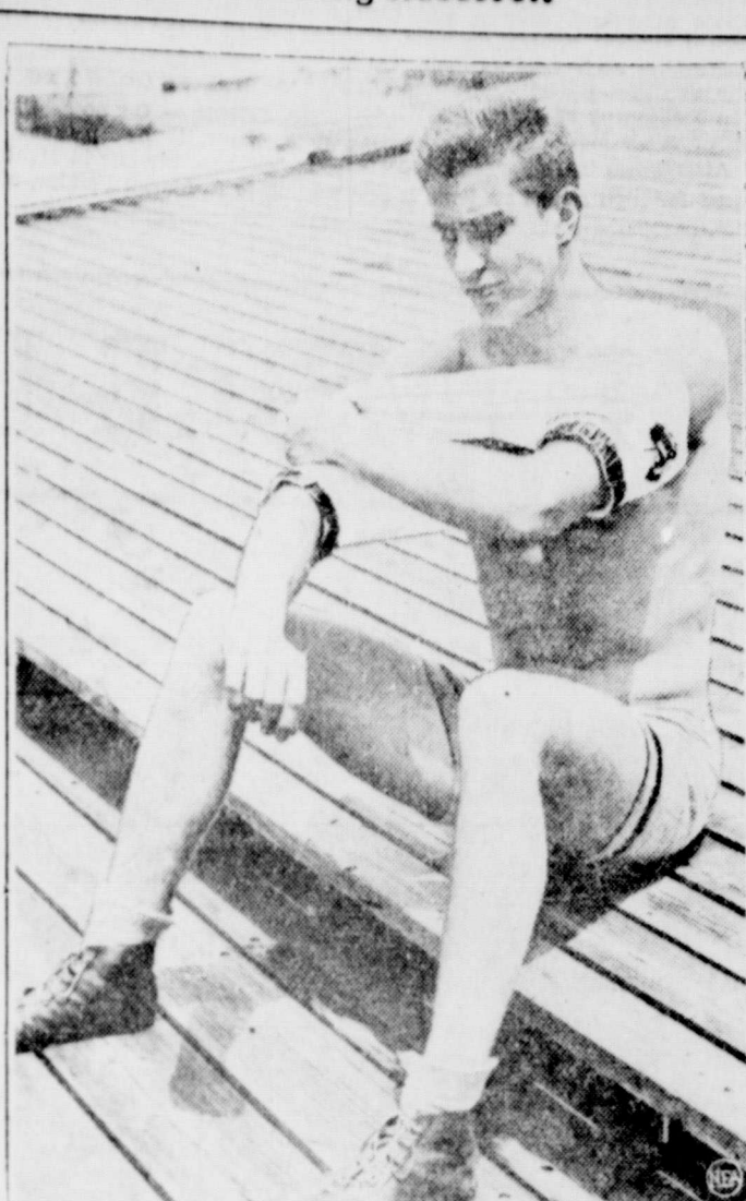
Camera-shy? Not a bit of it! Franklin D. Roosevelt, Jr. one-time photographer-chaser and camera-smasher, doesn't seem in the least self-conscious as he peels off his shirt preparatory to rowing practice with...