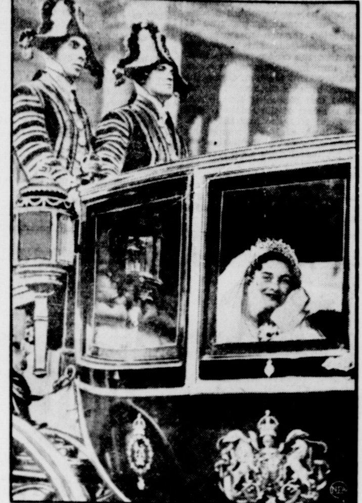
The fairy-book dream of every girl, this was the entrancing scene as lovely Lady Alice Montagu-Douglas Scott, descendant of the Stuart kings of England, rode forth to be married to the Duke of Gloucester, third son of King George and Queen Mary. Thousands of Londoners, lining the route, saw this ornate, royal coach, complete with austere coachmen and outriders in scarlet and gold, convey Lady Alice to Buckingham Palace for her wedding.