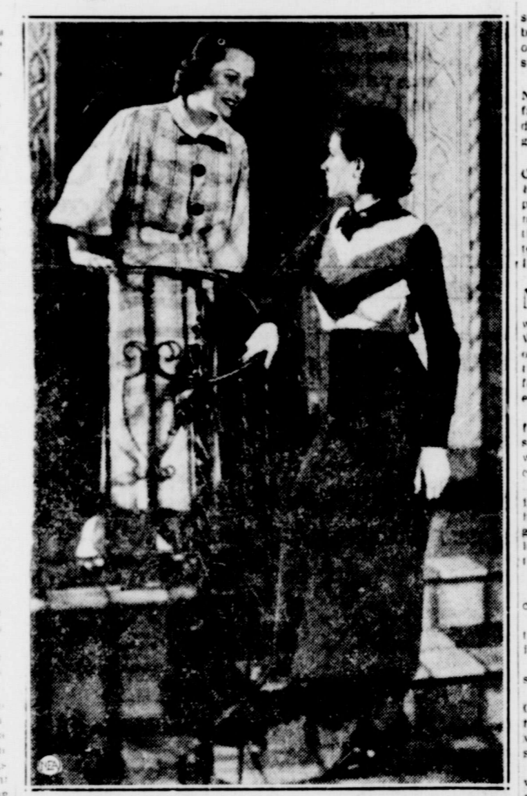
"Couldn't I go with you, Nancy?" Dana asked.

Continuation of the story from the previous page, starting with 'DANA picked up her book and tried to concentrate, but it was so much, Nancy, I'm sure it hasn't been anybody's fault that our mode of living has changed—just circum-