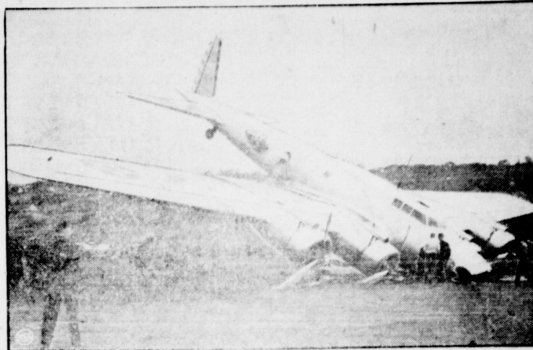
When this 16-ton "Flying Fortress" nose over in landing after a test flight in Seattle, Wash., the U. S. Army program calling for construction of 13 of the enormous bombers appeared to be threatened. Nose of the craft was crumpled and the four propellers were damaged because, preliminary investigation indicated, brakes were locked when the wheels touched ground.