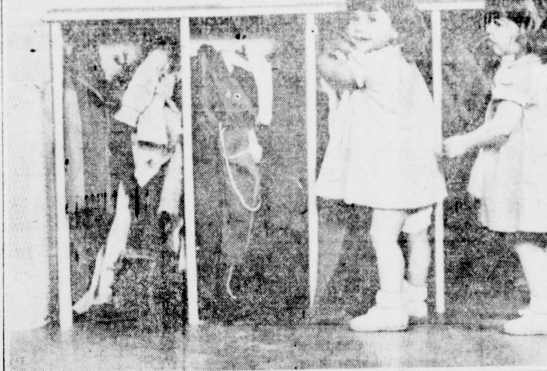
And here is another row of cubbyholes not at all like Mother Hubbard's. Each quin has a place for her clothes, marked off by symbols which the children can identify, though they could not be able to read their names. "A place for everything, and everything in its place," is the motto at the Dionne nursery, and the quins are already adept at keeping things orderly and clean.