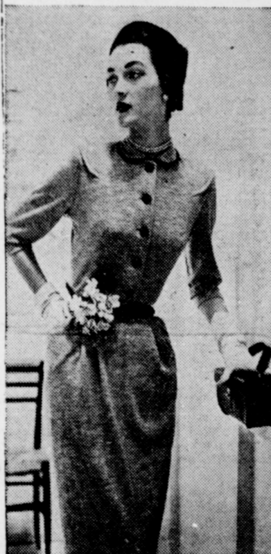
Cleverly-yoked shoulders and velveteen detailing feature this Wyner wool-jersey shirtwaister by Queen Make. It's from the November fashion pages of Good Housekeeping magazine, and comes in gray or natural to retail for about $18.