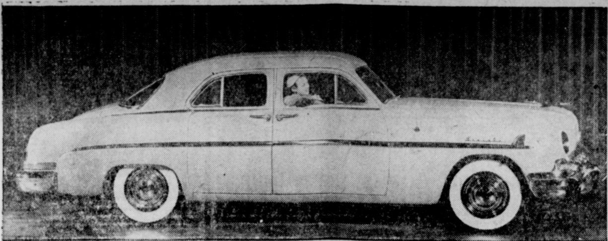
Smart new rear fenders and quarter panels, a greatly enlarged rear window, new bumpers and grille, and head lamps positioned nearer the outside edge of the fenders characterize the 1951 Lincoln. Interior changes consist of new trim schemes, new hardware, new package tray, re-styled steering wheel, new instrument panel control knobs and separate left and right hand controls for the ventilating system. The 1951 improved V-8 Lincoln engine has 154 hp.