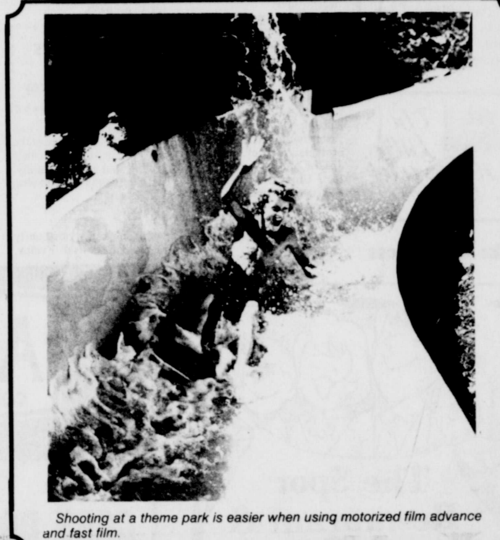
Shooting at a theme park is easier when using motorized film advance and fast film.

*Take at least one self-identifying photo—like some people standing beneath the entranceway to the park...something that will immediately set the scene for your slide show or picture presentation.