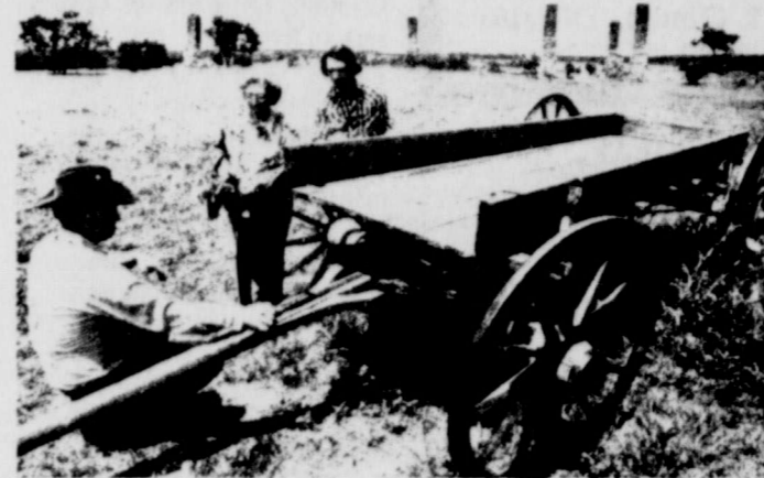
Visitors to Fort Phantom Hill north of Abilene inspect an old wooden wagon on the grounds. The Fort, established in 1851 to protect the frontier from Indians, suffered a series of hardships and was abandoned in 1854. Duty was hard and desertions were frequent because of monotony and loneliness. Only the stone commissary, guardhouse, and power magazine are intact.

Writer's Contest for the past two years, and this event gave participants a change to meet him.