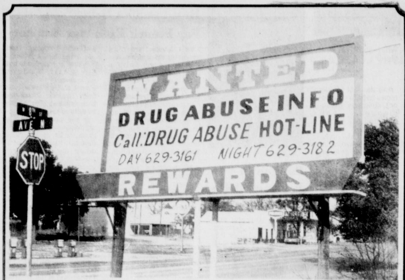
A NEWLY repainted billboard on West 8th Street in Cisco is sponsored by the People Against Dangerous Drugs (P.A.D.D.) Committee. The billboard asks for information leading to drug abuse. A spokesperson for the

P.A.D.D. Committee stated the billboard is "part of the ongoing effort to make people aware of the drug problem and put the committee's hotline numbers before the public."