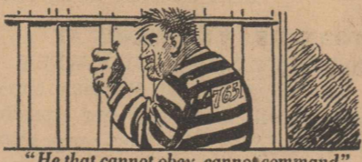
"He that cannot obey, cannot command"