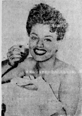
THIS IS COOL COMFORT

Bedtime beauty rituals should include ice facials with ice applied directly to the skin as shown by Kay Starr, Mutual's beautiful "Spotlight Bands" singer. You will enjoy the tingling refreshment as the ice technique closes up pores to help keep the skin dirt-free and healthy. Kay retains her velvet-smooth skin by using a weekly facial of patted on plain milk as a skin softener. Left on overnight, the milk mask works wonders in softening the tissues.