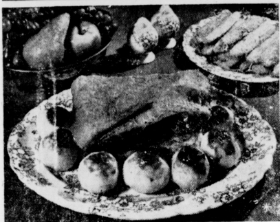
When the family dinner features brisket of beef, good flavor and hearty satisfaction await you! This thrifty cut is simmered gently to delicious tenderness...