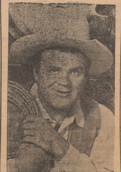
Dan Blocker ☆☆☆

Austin, Tex. — Dan Blocker, a really "big" man, will be the recipient of the Texas Press Association's 1963 "Texan - of - the - Year" award.