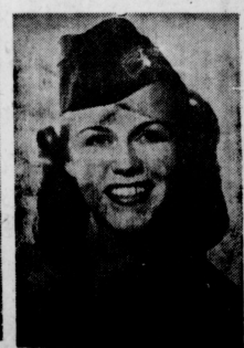
to be principal speakers at regional conference of warchest leaders. At the conference plans will be laid for the October Campaign on behalf of the National War Fund.