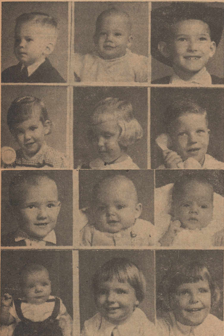
PHOTO CONTEST WINNERS ANNOUNCED