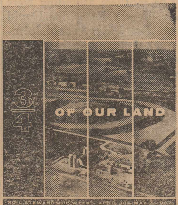
OUR IDENTITY WITH THE LAND