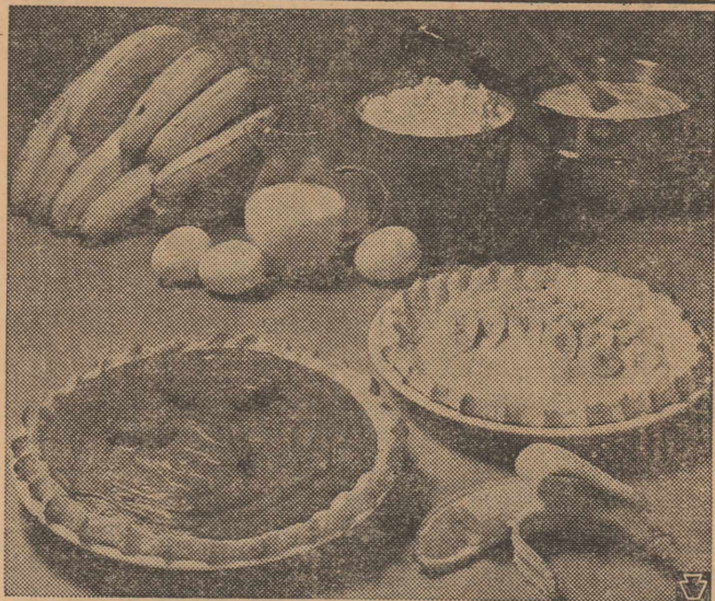
The Cream Of The Crop

Two favorites with men, with everyone in fact, are banana cream pie and chocolate cream pie. Both are made from a basic cream pie recipe using the traditional corn starch method.