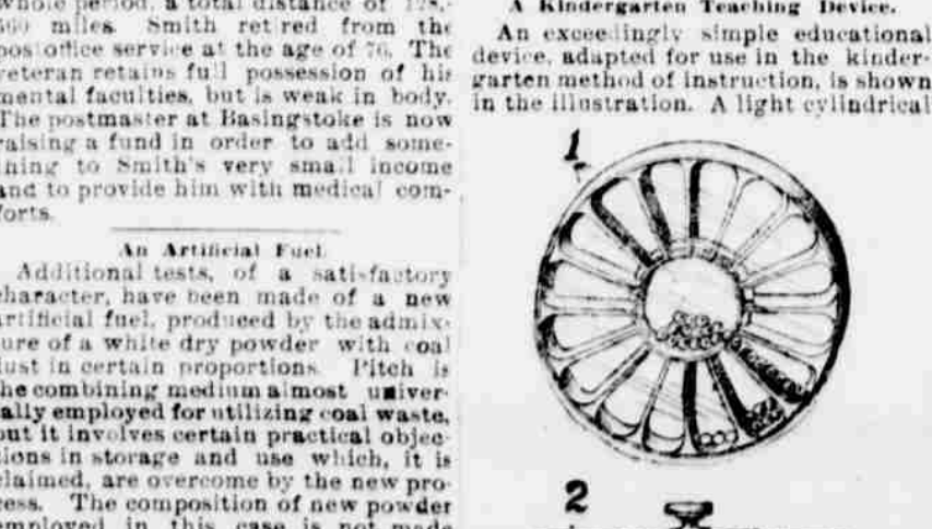
ADVANCE IN CHEMISTRY.