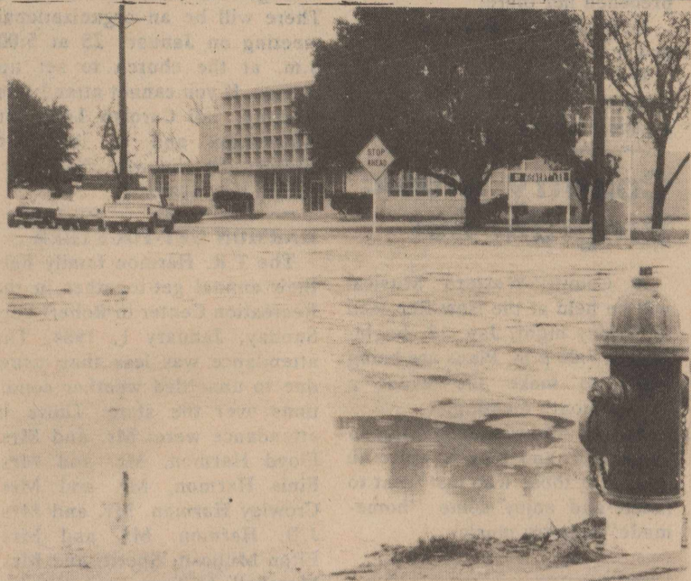
RAIN CAME TO Coke County Sunday and Monday and left messy but welcome puddles in the area.