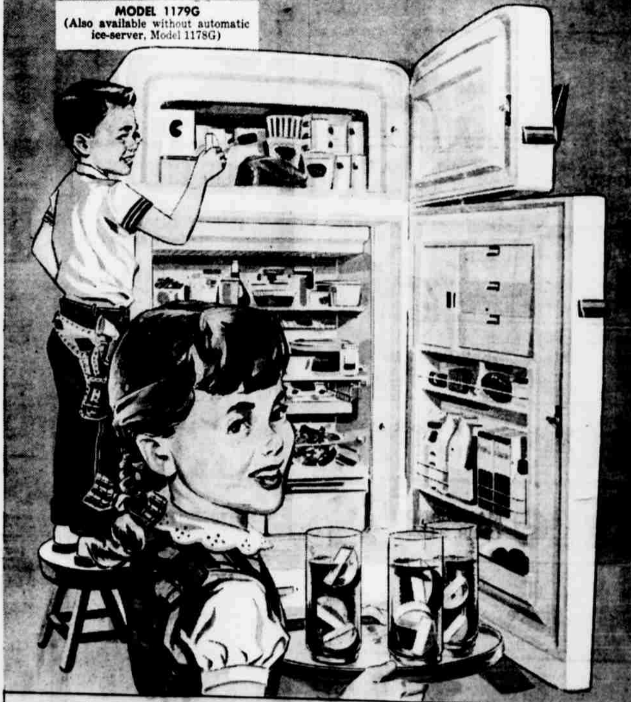
MODEL 1179G (Also available without automatic ice-server, Model 1178G)

Serves ONE ice cube at a time or a BUCKETFUL