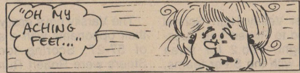
Homemakers walk an average of 4.3 miles per day.