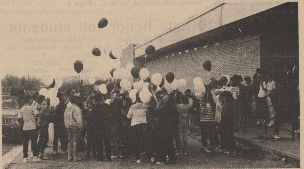
A balloon lift-off opened FHA Week activities for Robert Lee High School last week.

Fish Sticks w/tarter sauce Cole Slaw Tator Tots w/catsup Hush Puppies Canned Fruit Milk