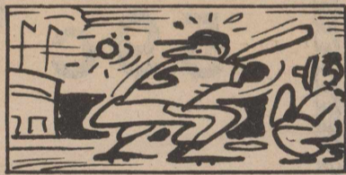
The millionth home run in Major League Baseball history was scored by Bob Watson, Houston Astro first baseman on May 6, 1975.