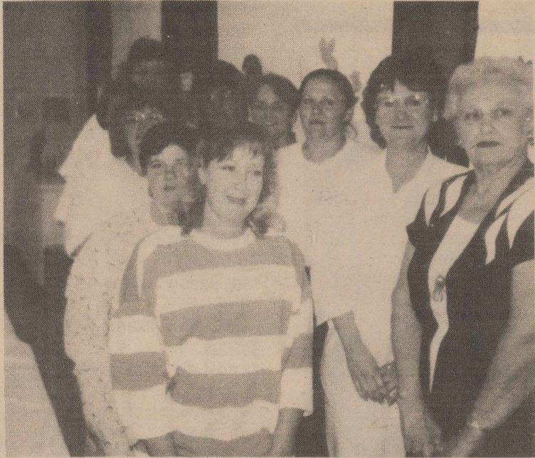
Pictured above are the RNs and LVNs at the Bronte Nursing Home.

The public is invited to attend all the activities at the Nursing Home Week.