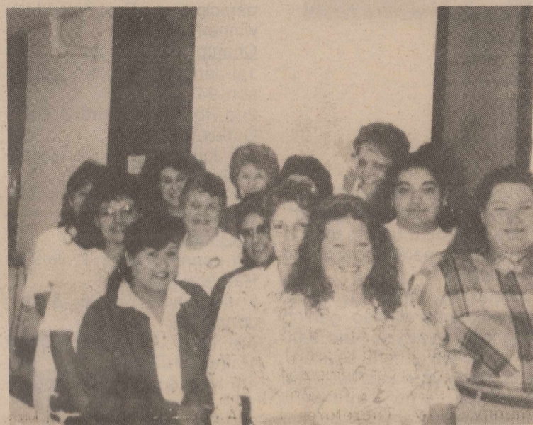
Pictured above are the Nurses' Aides at the Bronte Nursing Home.

There are more than 4,000 varieties of tomatoes.