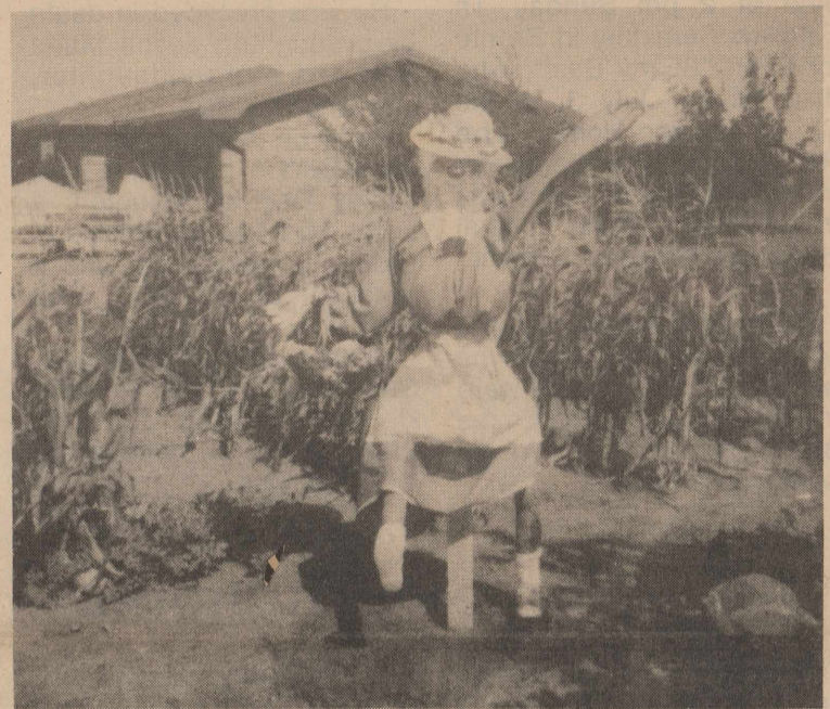
The "Harvest Lady" waves to passers-by while watching over the Campbell's garden in Bronte.

Ken and Katie Campbell of Bronte and their daughter, Roxie Belew, of Big Spring made and fashioned the waving lady with the harvest basket on her arm last week and placed it in the garden and orchard.