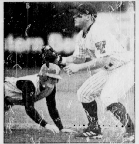
Tech to take on OSU at Dan Law Field .....p.8