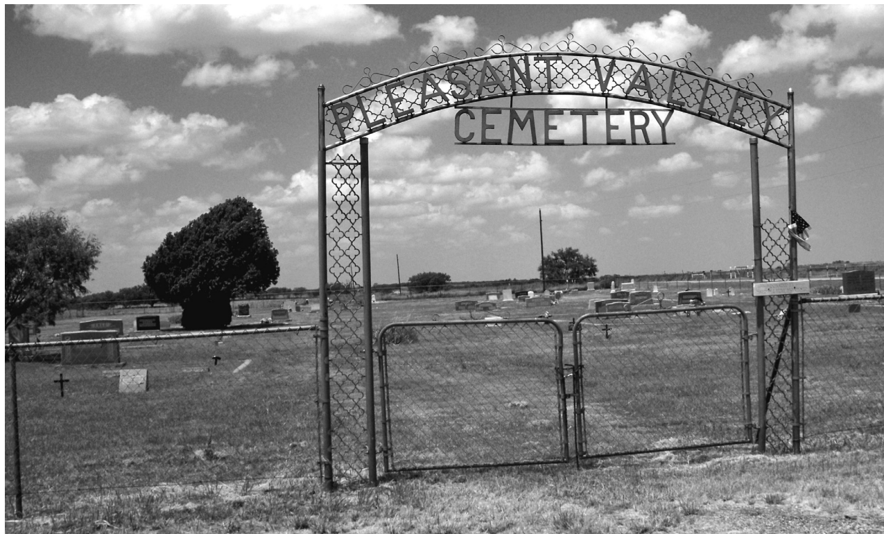
Rural cemeteries, such as Pleasant Valley, are in need of donations for maintenance and upkeep.