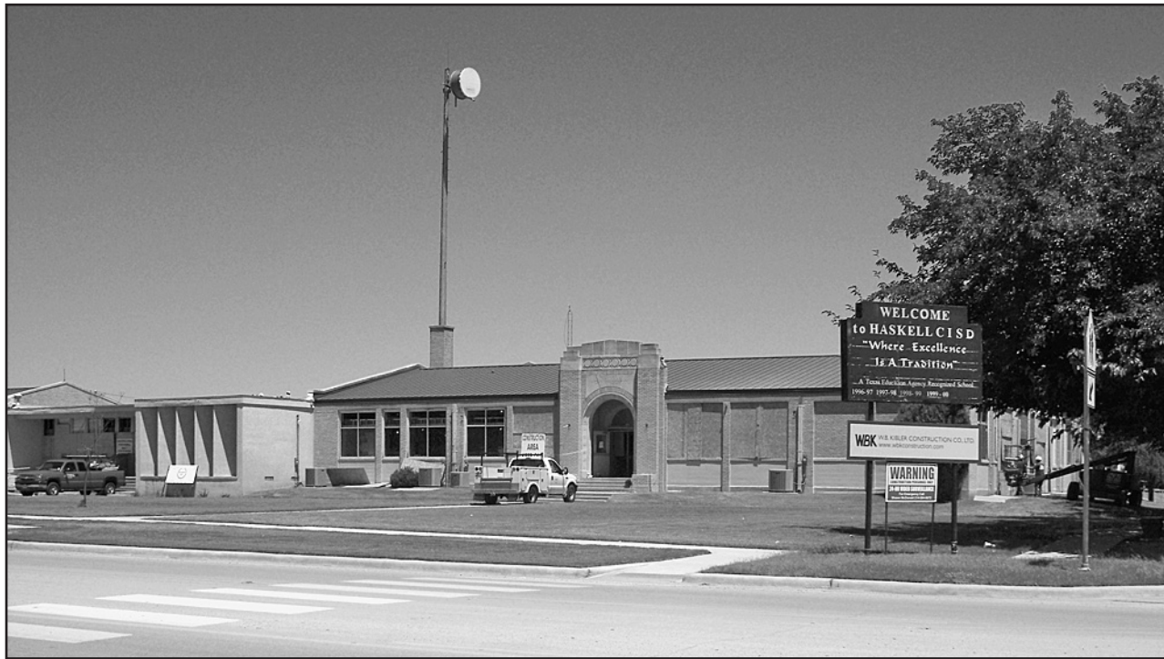
CONSTRUCTION CONTINUES —The remodel of Haskell High School continues with plans for the project to be completed in late October or early November.

An open house, to showcase the improvements will be held when the project is completed.