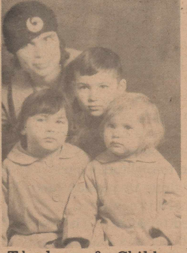
January 27, 1932