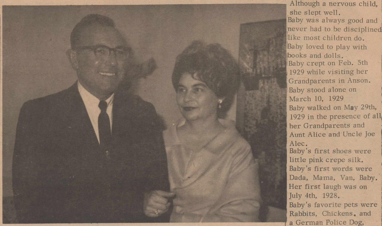
To My Dear Parents-----

Fifty years seems more like your age - than the number of years you've been married. How proud and pleased we are to share our thoughts and memories about you two with many of our friends. You know, of course, how precious and special you are to us. We wanted to say so in a "SPECIAL" way for your anniversary.