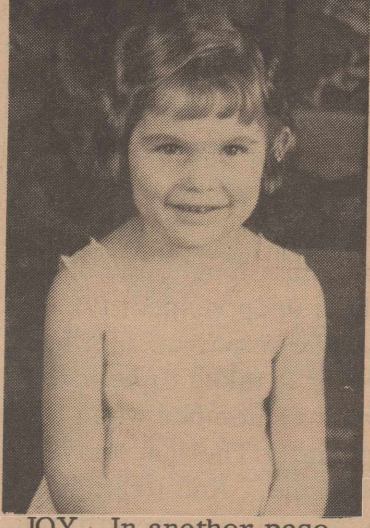
JOY In another pose. 5 yrs. old