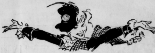
Bonnie, the Plaid Lassie®

Thursday night the Cougars and Braves will play on Clyde field. The Cougars have a 3 win 3 loss record, as of Monday night.