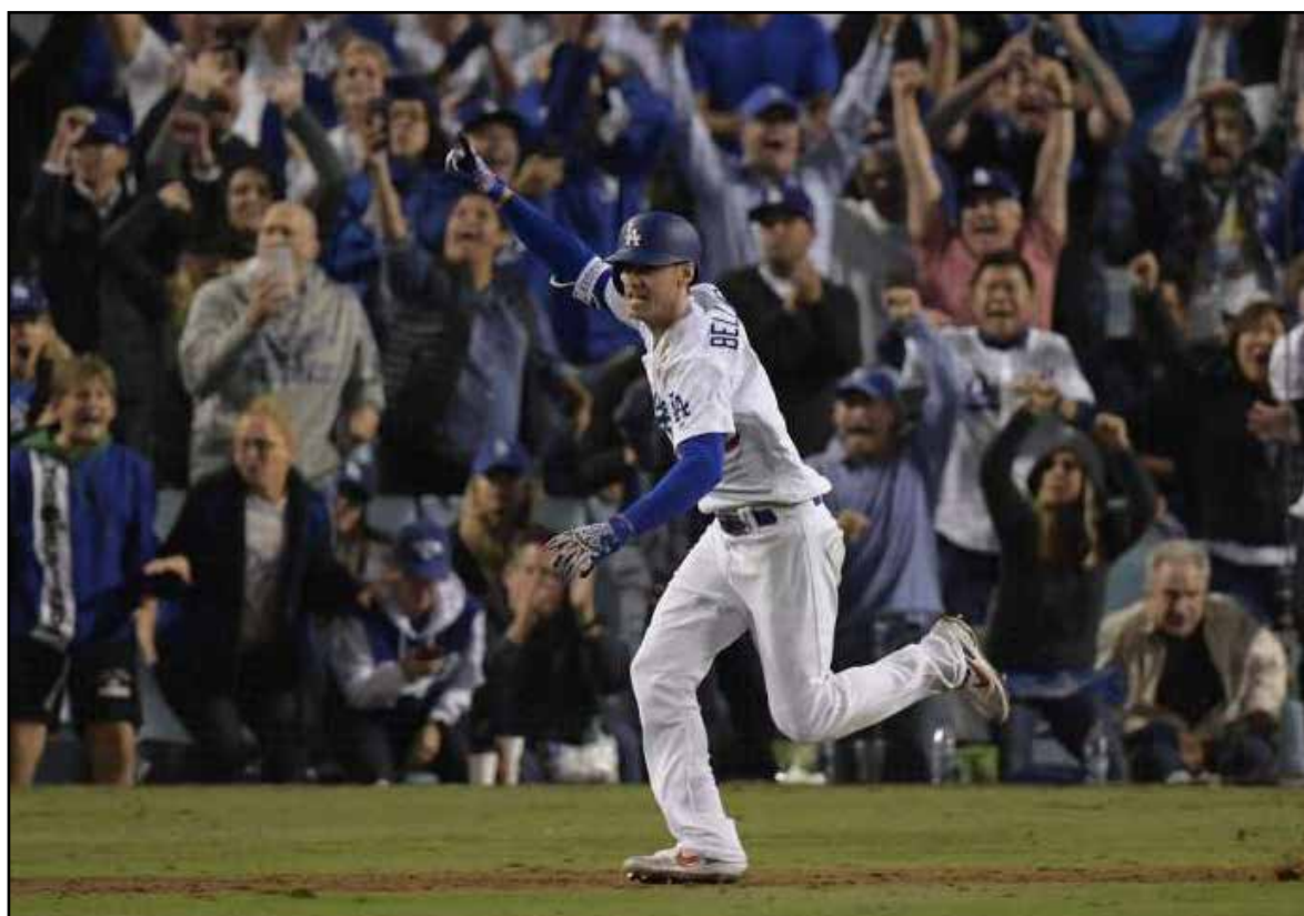
Los Angeles Dodgers' Cody Bellinger reacts after hitting a walk-off hit during the 13th inning of Game 4 of the National League Championship Series baseball game against the Milwaukee Brewers Tuesday, Oct. 16, 2018, in Los Angeles. The Dodgers won 2-1 to tie the series at 2-2.