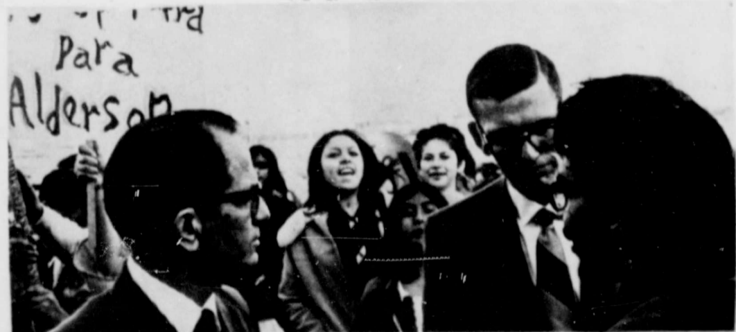
Unwelcome tete-a-tete; There was unsavory togetherness of students, Administration, and the Editor of La Voz. No había Bienvenida