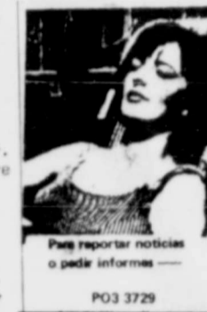
Pass reporter notices o pedir informes PO3 3729

SUPPORT FOR TAHOKA PEOPLE --Alderson Jr. High students wearing brown armbands and carrying posters "Tahoka Chicanos, Va manos--we're with you all the way!"