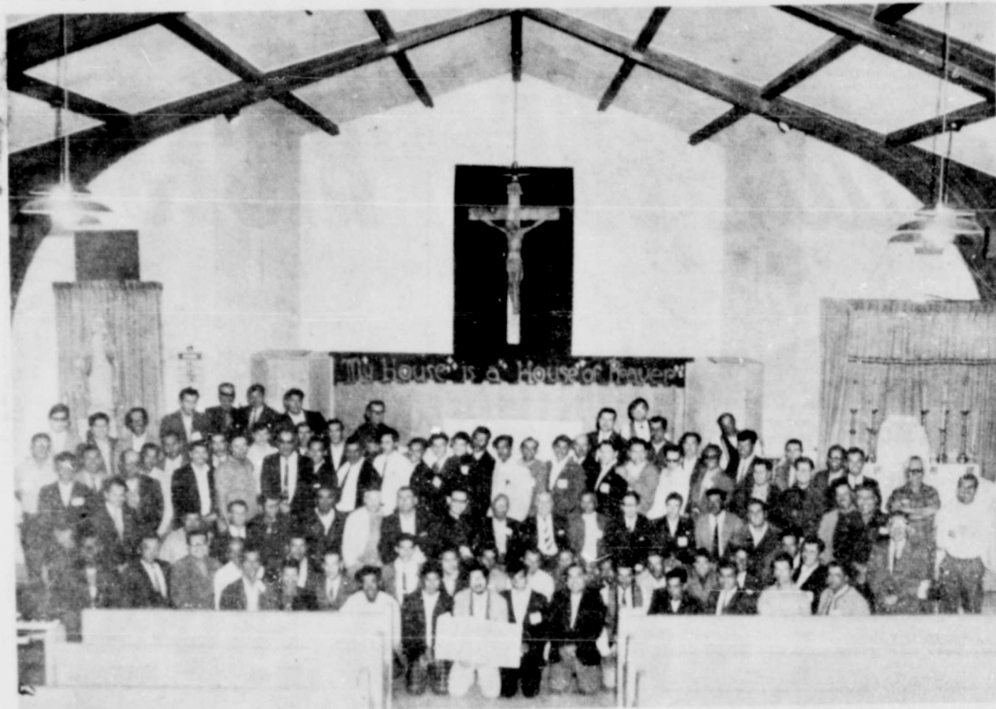
These are the Auxiliaries and new Cursillistas that lived a Cursillo. The Cursillo was the number 222 of the Diocese of Amarillo. The cursillo took place in Our Sacred Heart Catholic Church of Littlefield, Texas.

Estas personas fueron Auxiliares y nuevos Cursillistas del Cursillo numero 222 de la Diocesis de Amarillo. El Cursillo se llevo a cabo en la Iglesia Catolica del Sagrado Corazon en Littlefield, Texas.