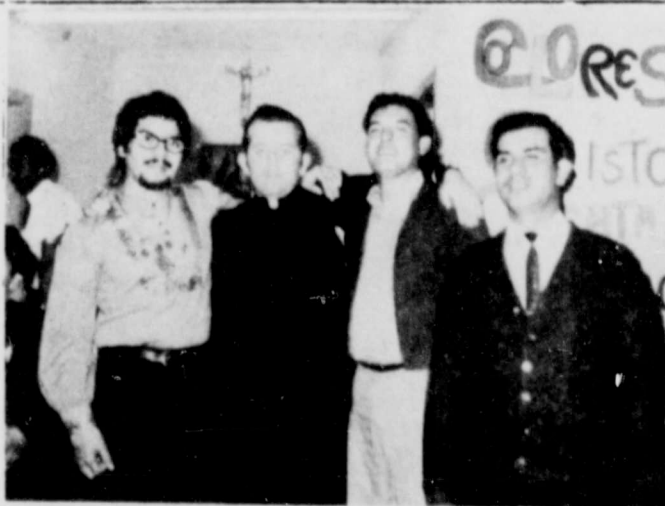
Chauser's Pilgrimage? The Editor, the Priest, the Apostle, and the "Auxiliar."