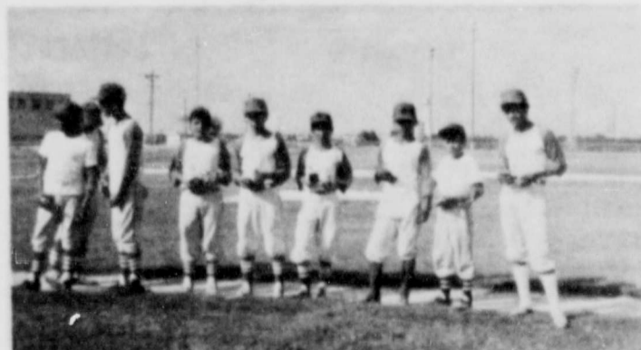
PELOTEROS DE LA PARROQUIA DE NUESTRA SRA. DE LA GRACIA!!!