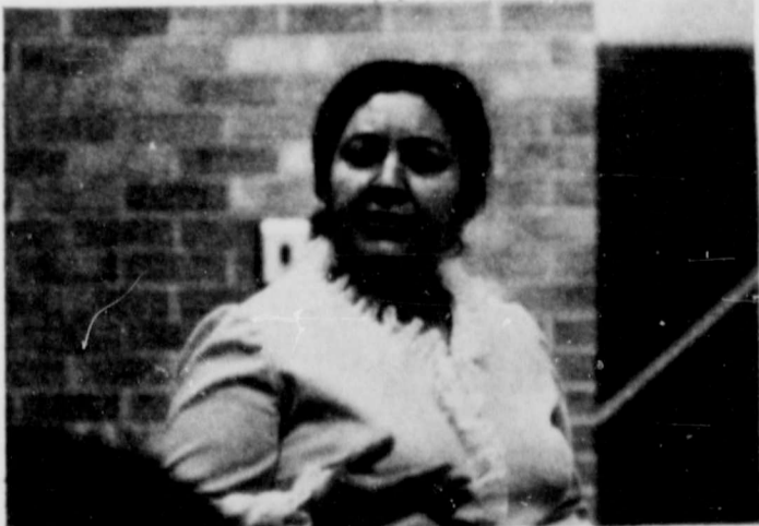
"El Respeto al Derecho ajeno es la Paz." "Respect for the Rights of Others is Peace."