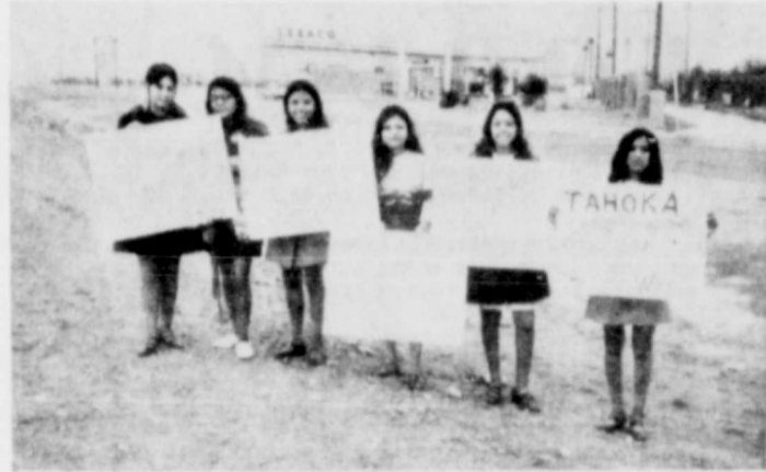
SPECIAL --(minutes before press time)--Students at Alderson Jr. High, in response to the suspension of students in Tahoka, are wearing armbands and carrying signs, such as "Brown Power in Tahoka" and "Lubbock Chicanos support Tahoka Chicanos!" These students were walking to school this morning very early. They said that Estacado H.S. Students were with it, too.