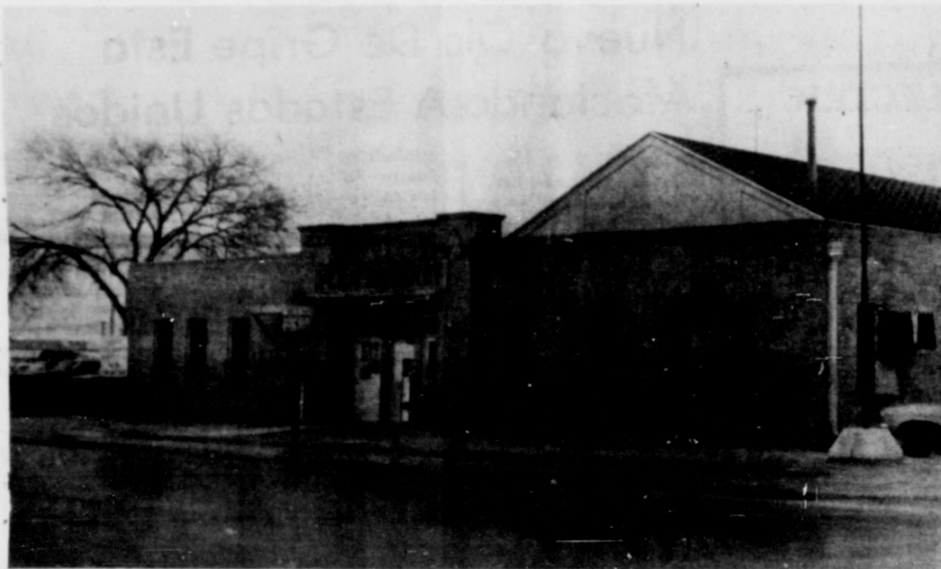
ESTE ES EL EDIFICIO DONDE ESTA SITUADO EL FLEA MARKET DONDE USTED PUEDE HACER SUS COMPRAS EN EL CONFORT DE SUS CALENTADORES

THIS IS THE BUILDING WHERE YOU CAN SHOP IN THE COMFORT OF OUR HEATING UNITS.