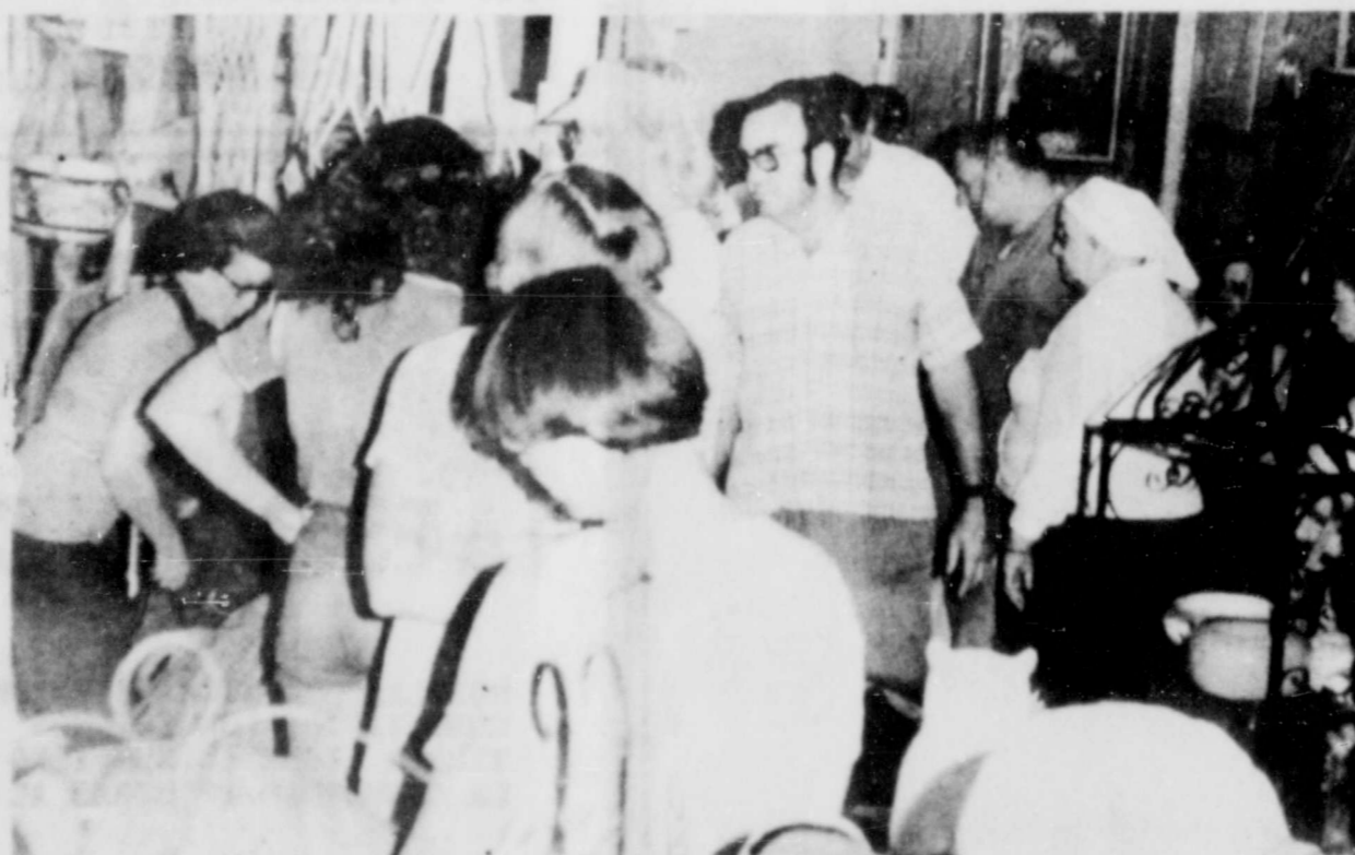
ESTA ES UNA ECENA DE LA CANTIDAD DE PERSONAS QUE ASISTEN A HACER COMPRAS CADA DIA DE FIN DE SEMANA, VENGA USTED TAMBIEN

THIS IS THE BUILDING WHERE YOU CAN SHOP IN THE COMFORT OF OUR HEATING UNITS.