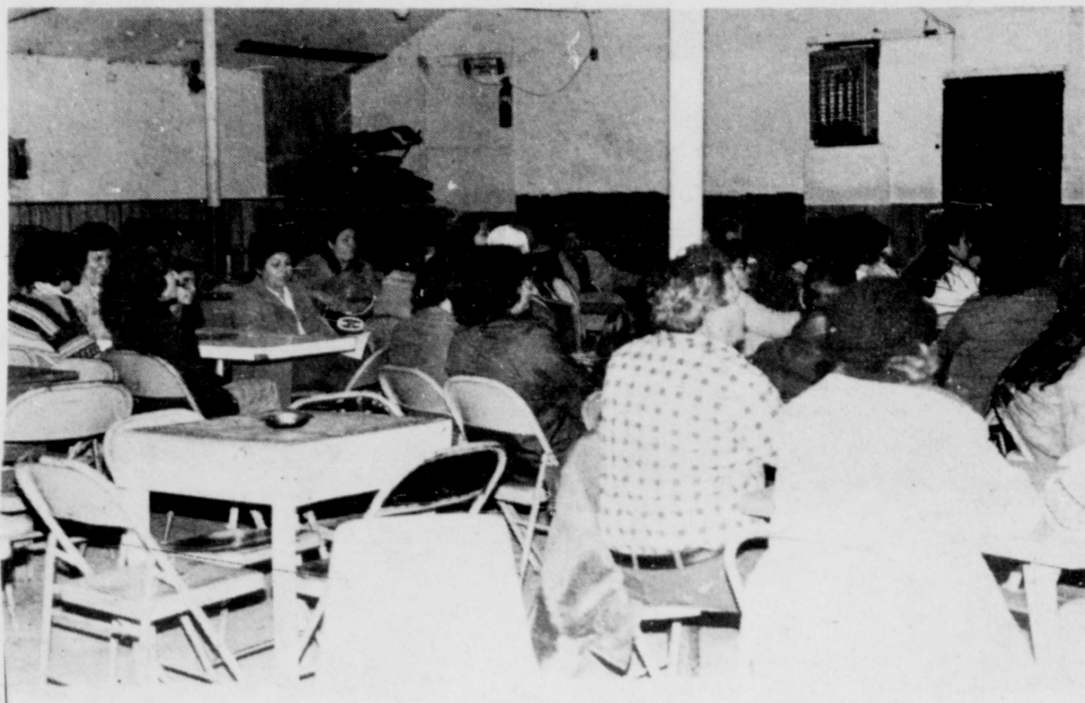
La Voz del Mexicano Newspaper was born at a meeting at which more than 80 persons from Dimmitt, Hereford, Hart and Earth attended. The paper will

be published to inform the citizens of these communities as to their rights and how to better their lives.