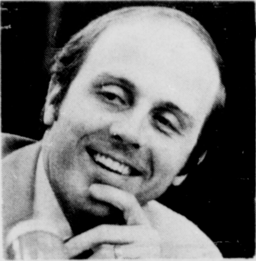
Kent Hance En Hereford

El Sabado 21 de Marzo el Congresista Kent Hance hablando con un grupo de gente en Hereford tocante a los temas de la economia, el MX missile y ayuda a otras naciones. Como todos los politicos nada más dijo lo que ella gente queria oír. Sentado con un grupo de gente que debian de ser humanitarios se vio claro que el único interes era la protección de si mismo. No les importa nada de derechos humanos ni nada concierniente al projimo.