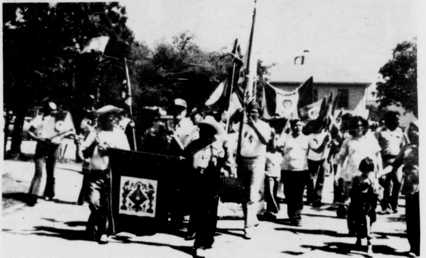
In 1977, Texas Farmworkers Union members marched from Austin to Washington D.C. in an effort to gain collective bargaining rights and repeal of the Right to Work (for less) Laws.