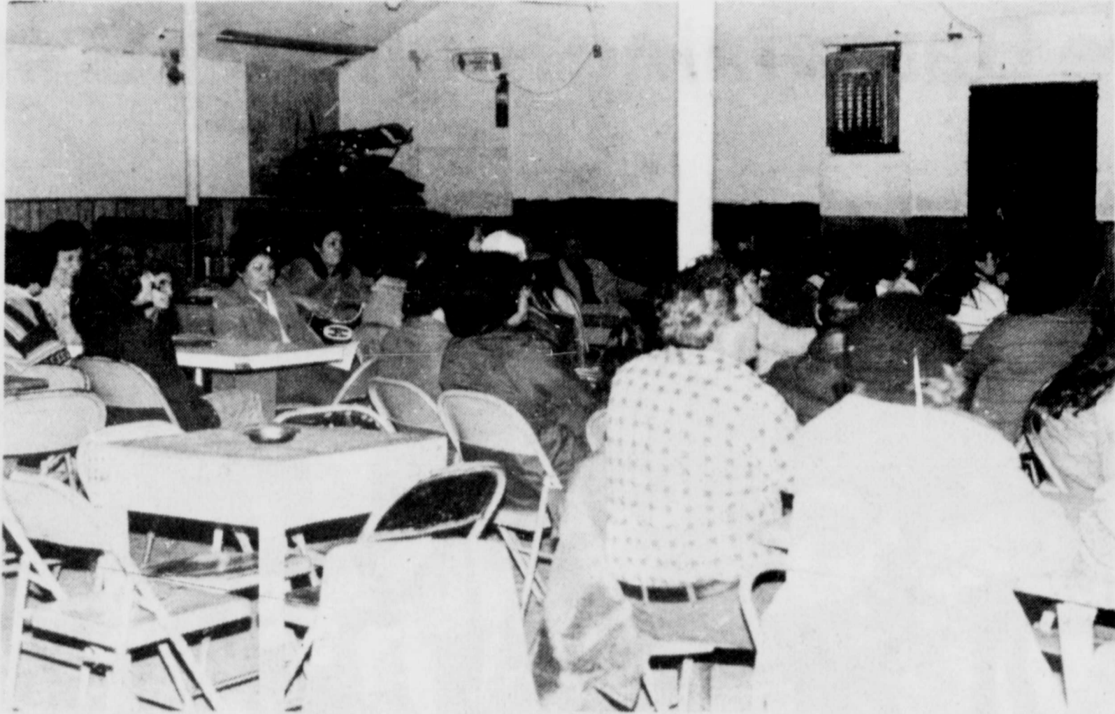
More than 80 residents of Dimmitt, Hart, Hereford and Earth gathered several weeks ago to plan the publication of this newspaper, La Voz del Mexicano. The newspaper was established to better inform residents of both their rights and how to progress toward bettering their lives and family.

different names for this paper. After nineteen names were submitted, one was voted on, with the understanding that it may be changed later in the future.