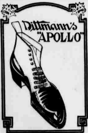
SMART SHOES FOR DRESSY MEN

We would appreciate a visit from all of you, we will not urge you to buy, but only ask a chance to show our goods. We are willing to leave the rest to your own good judgment.