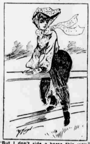
"But I don't ride a horse this way," said Chice, miserably.

I took the sunshade and waited Chloe's two feet were now on the lowest bar. She peered over. The stile let down beyond in a big drop into a kind of hollow or ditch.