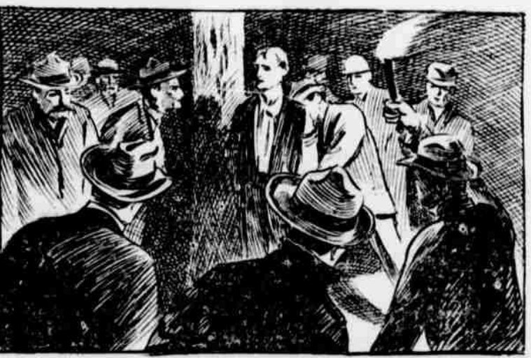
"String me up at once and be done with it."

Shaw Will Tour the South. Washington.—Secretary Shaw will leave Washington on September 7 for a campaign tour through the south, where he will speak in several states.