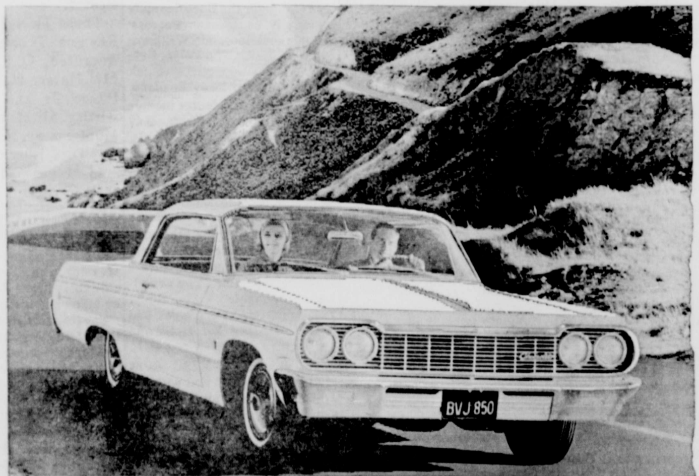
Chevrolet Impala Super Sport Coupe

It's Trade 'N' Travel Time at your Chevrolet dealer's—the perfect time to try the Jet-smooth ride. Find the meanest stretch of road you can. Then see for yourself how straight a crooked road can feel.