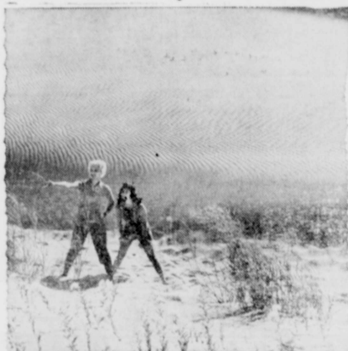
MONAHANS SANDHILLS STATE PARK—Both children and adults enjoy the cool, clean sand at Monahans State Park, a 15-square-mile area of wind sculptured sandhills in West Texas.