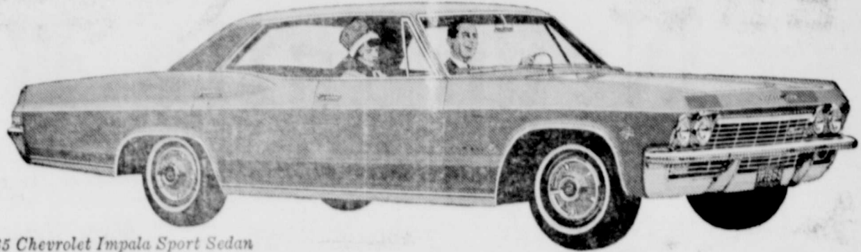
'65 Chevrolet Impala Sport Sedan