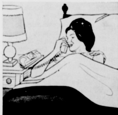
ANOTHER TELEPHONE IN THE BEDROOM