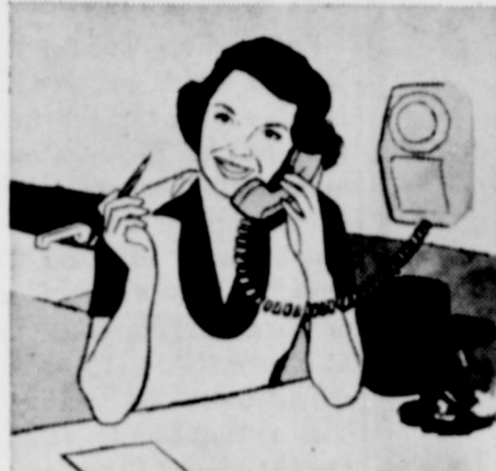
ANOTHER TELEPHONE IN THE KITCHEN

You don't have to run, when you have more than one