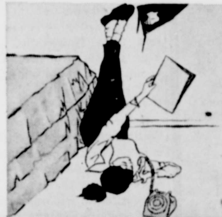
ANOTHER TELEPHONE FOR TEEN-AGERS