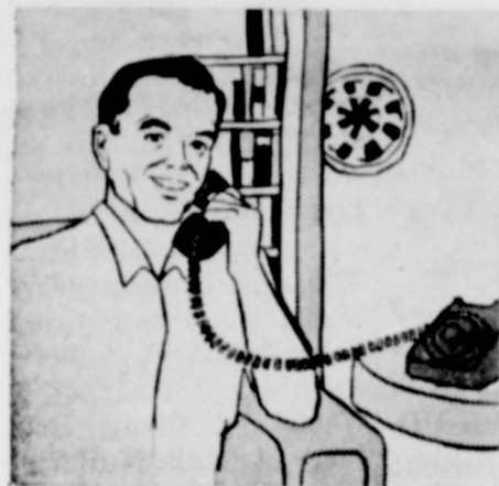
ANOTHER TELEPHONE IN THE DEN