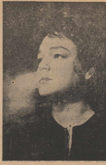
FIERY STAR... Academy award winner Simone Signoret sports a Bette Davis-like jet of cigarette smoke on location for her new film, "Barabbas."

A friendly welcome awaits you at any service of the First Christian Church